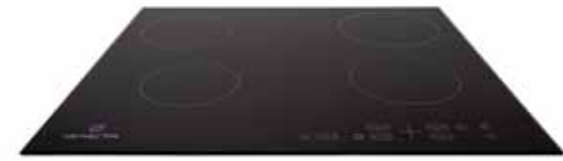
Ceramic cooking hob